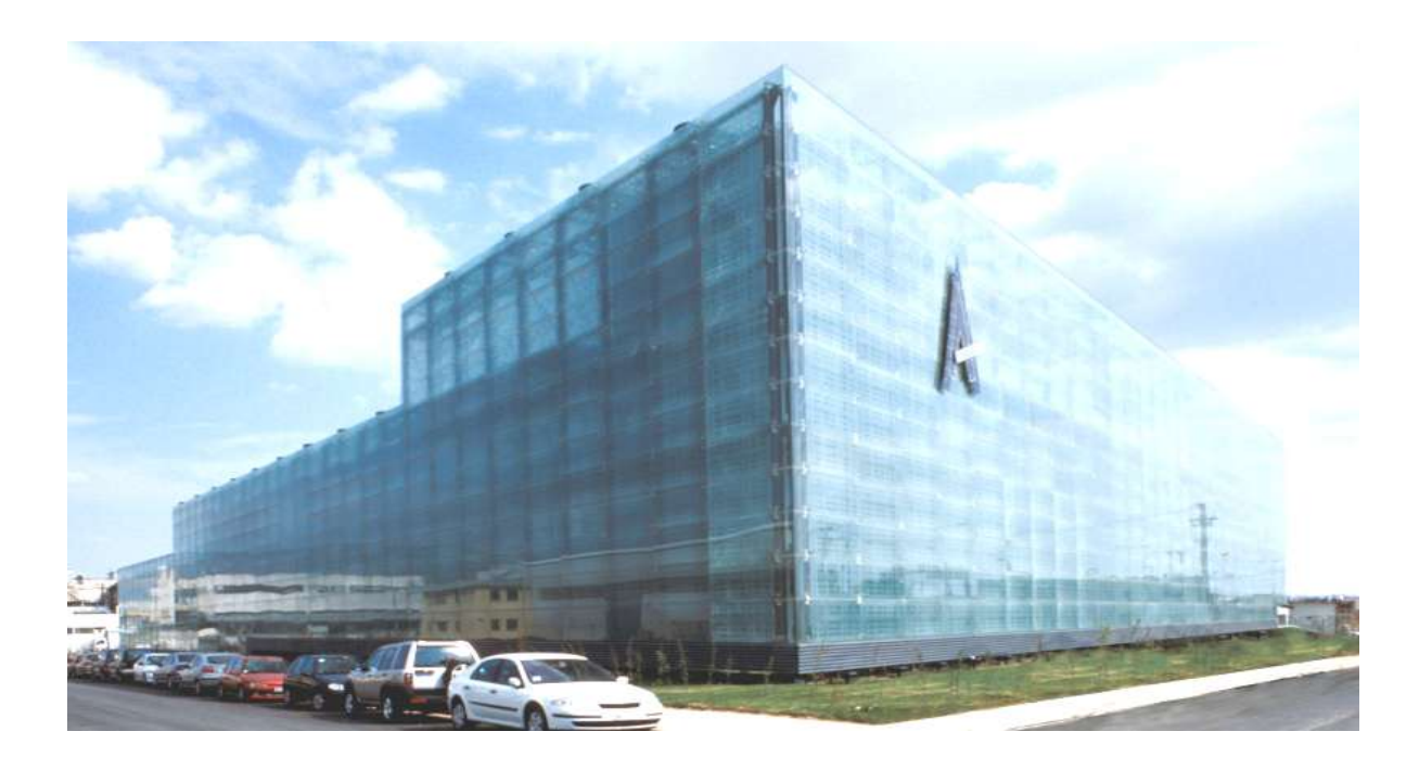
Office building complex of Alfa-Alfa Holdings: side facing Kifissos river

The company Alfa-Alfa Holdings is housed in a complex of four buildings, featuring a terrace in the center and a unified underground car parking station. Pictured below, the building complex was constructed in a 10.000 \, \mathrm{m}^2 lot near the Kifissos River. While three of the four buildings have four stories and - among other ways - communicate via a bioclimatic corridor that surrounds them, the two-storied fourth building is independent and communicates with the others only through the underground level. The entirety of the buildings is ordered in the perimeter of the lot, while the middle space is shaped like a terrace.