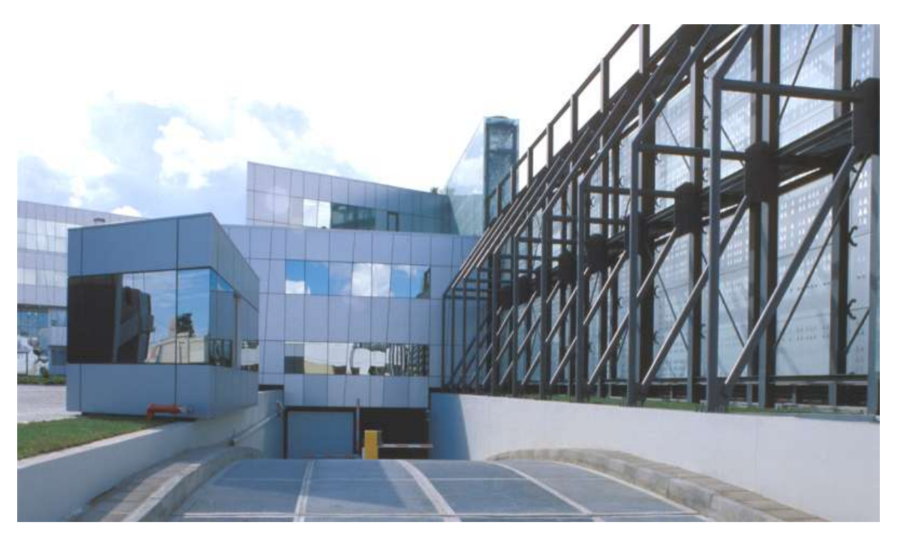
Office building complex of Alfa-Alfa Holdings: Entrance to car parking station

The buildings have a wedge type shape and present significant architectural variations from level to level - for example, there are spaces of increased height and cantilever projections of the floors.